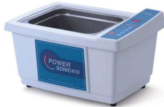
POWERSONIC 410 (10liter)