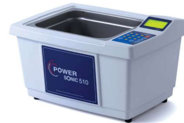
POWERSONIC 510 (10liter)