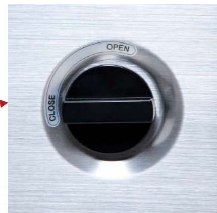
Drain Knob for 605/610/620