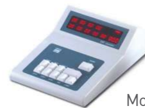
Model 309DF (9 Keys)