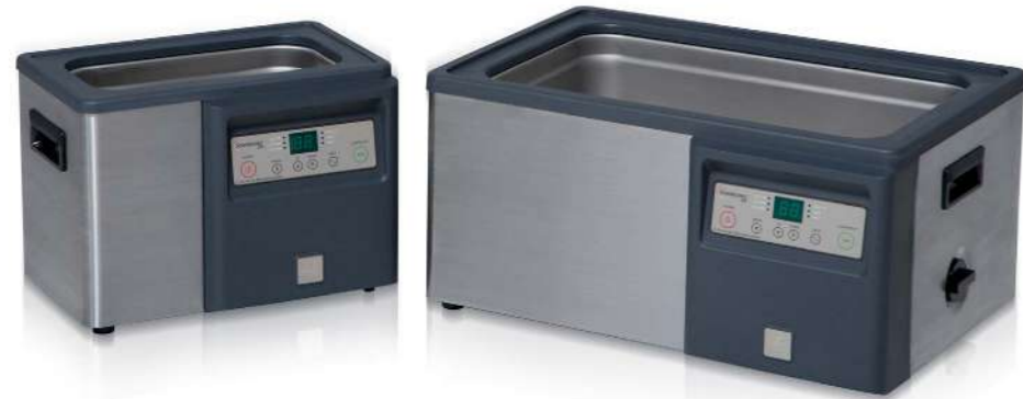
POWERSONIC 605/620 (5liter/20liter)