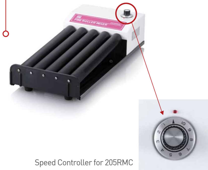
Speed Controller for 205RMC

The model 205RMC has an adjustable speed control between 12~70 rpm. Details are as a table below.