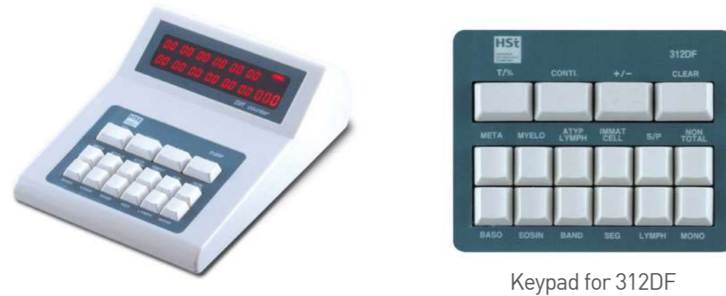
Keypad for 312DF