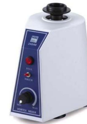
Model 250VM (Test Tube Type)