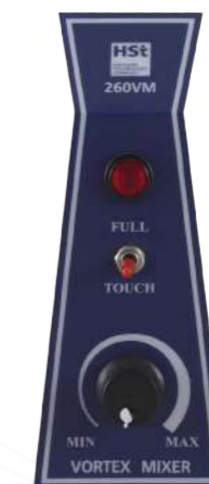
Control Panel for 260VM